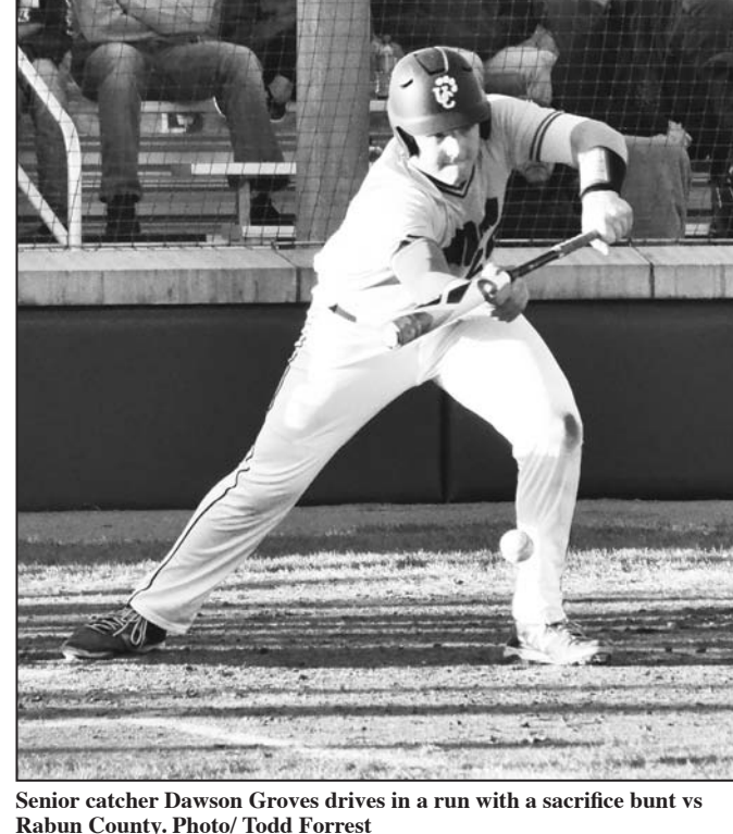
Rabun County.

Four singles in five at off Nachtrieb to open the inning put Rabun on top 9-8. An \widetilde{RBI} groundout and an RBItriple made it an 11-8 game before Nachtrieb escaped further damage with an inning-ending