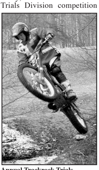
Annual Trackrock Trials

At 9:30 a.m. on Saturday, there will be a Youth